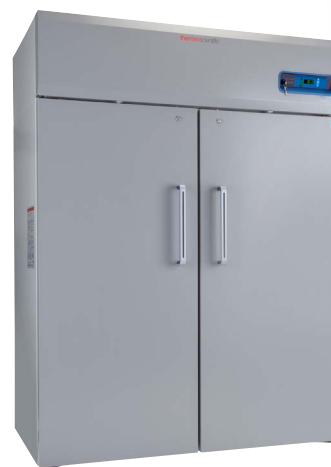
Thermo Scientific™ TSX 50 cu ft freezer