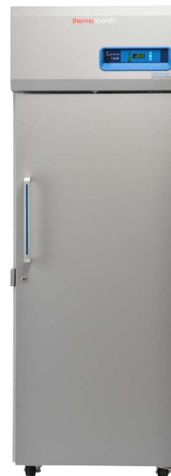
Thermo Scientific™ TSX 23 cu ft freezer