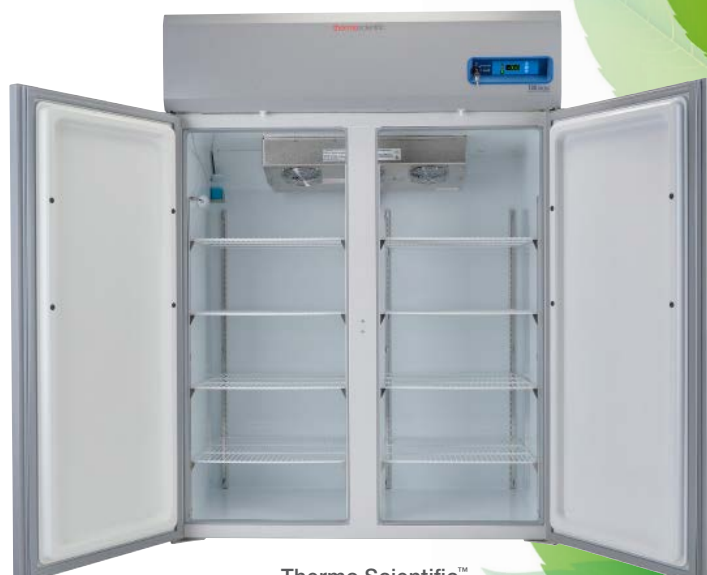
Thermo Scientific™ TSX 50 cu ft refrigerator