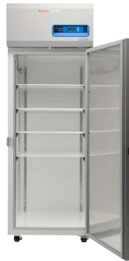
Thermo Scientific™ TSX 23 cu ft Manual Defrost Freezer