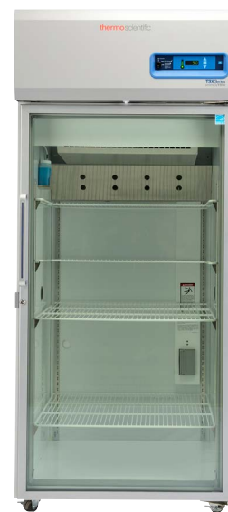
Thermo Scientific™ TSX 30 cu ft chromatography refrigerator