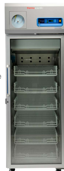
Thermo Scientific™ TSX 23 cu ft pharmacy refrigerator