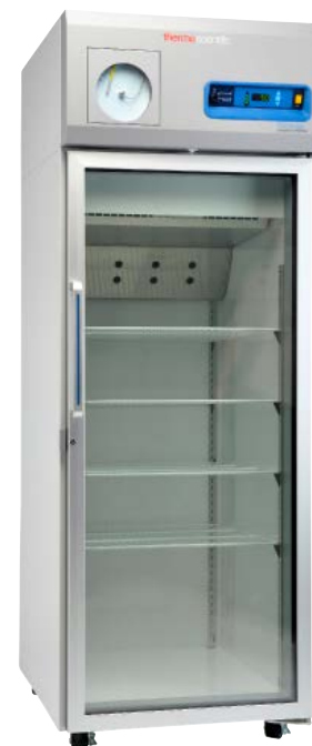
Thermo Scientific™ TSX 23 cu ft refrigerator