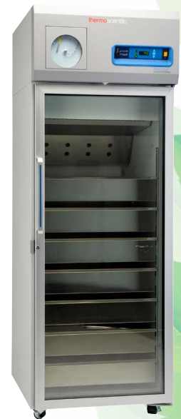
Thermo Scientific™ TSX 23 cu ft blood bank refrigerator