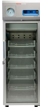
Thermo Scientific™ TSX 23 cu ft Pharmacy Refrigerator