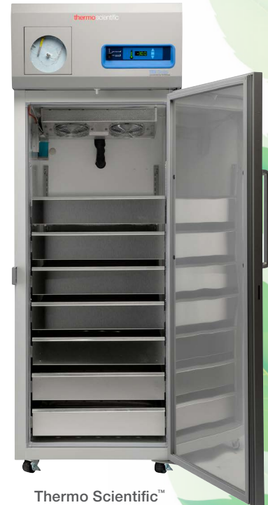
Thermo Scientific™ TSX 23 cu ft plasma freezer