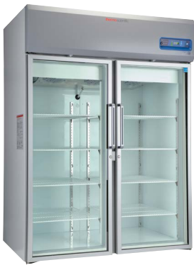
Thermo Scientific™ TSX 50 cu ft Refrigerator