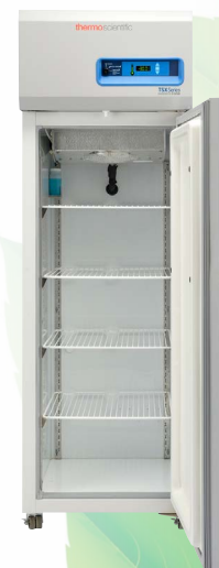
Thermo Scientific™ TSX 12 cu ft freezer