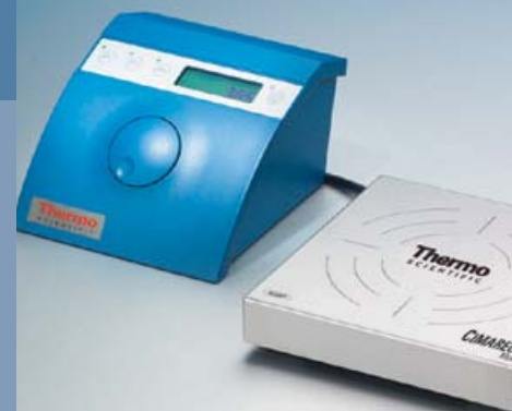
Cimarec i Maxi with Telemodul 20 C