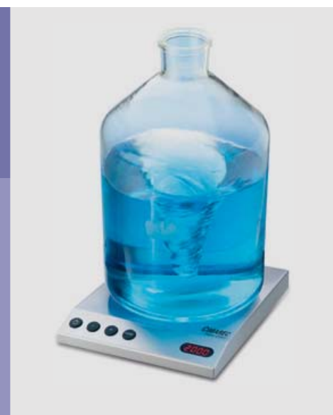
Cimarec Power Direct