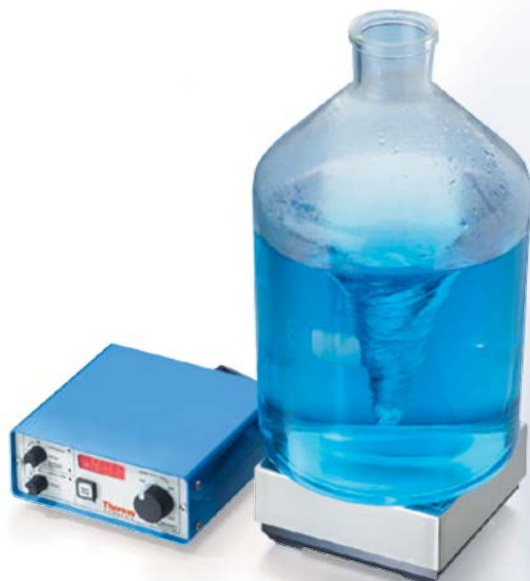
Cimarec Mobil 200 with Telemodul 40 M

Operating conditions are -10 to +56°C at 100% rH