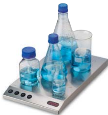
Cimarec i Series Multipoint 15