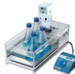
Submersible in 50°C Bath Pages 5 and 7