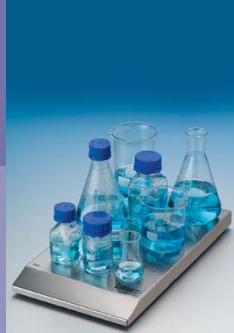
Cimarec i Telesystem 15