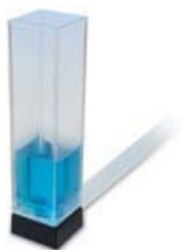
Stir Tiny Cuvettes Page 2