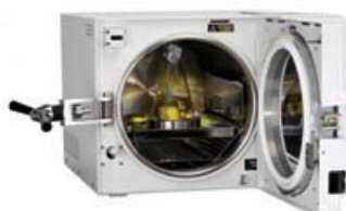
Used in Sterilizers at 121°C 2 bar Pressure Page 11