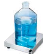
Stir 600 L Carboys Page 12