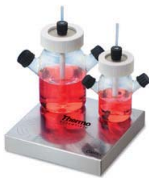
Cimarec Series Biosystem 4