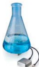
Submersible in 95°C Bath Page 3