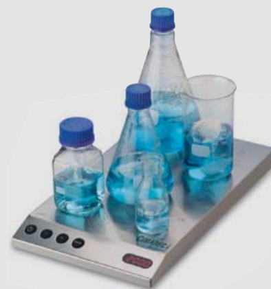
Cimarec i Multipoint 15