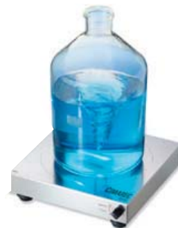
Cimarec Series Mobil Direct