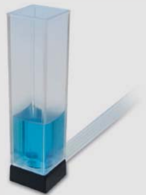
Cimarec i Mini