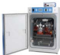
Used in CO 2 Incubator Page 10