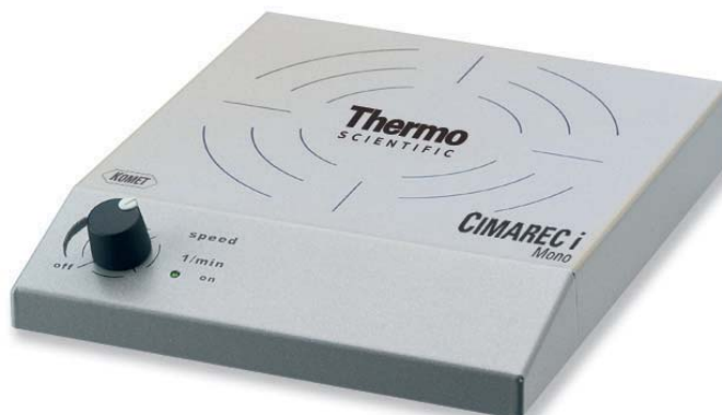
Cimarec i Mono Direct

Operating conditions are -10 to +40°C at 95% rH 100-240 V units contain a cord set with various plugs