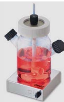
Cimarec Biosystem Direct