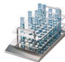
Stir 60 Positions Simultaneously Page 9