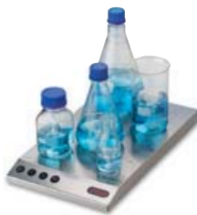
Built-in Controller Convenience Page 6