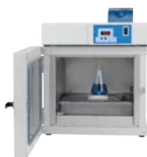
Used in General Purpose Incubator Pages 5 and 7