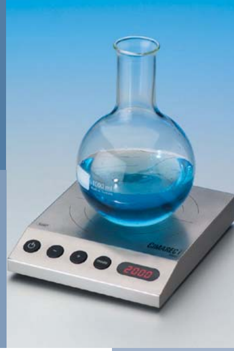
Cimarec i Maxi Direct