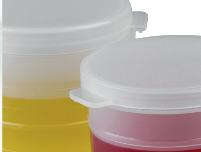
Thermo Scientific Capitol Vial Polypropylene Containers